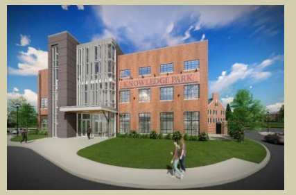
Knowledge Park at York College